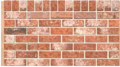
Tumbled Brick Kansas