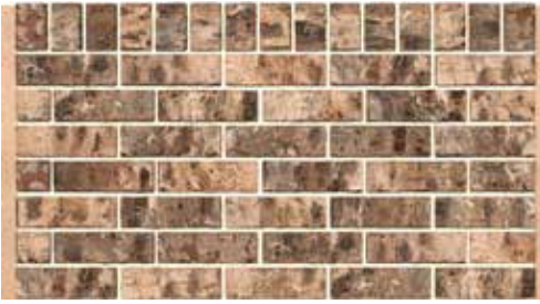
Tumbled Brick Colorado