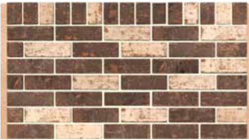
Tumbled Brick Boston