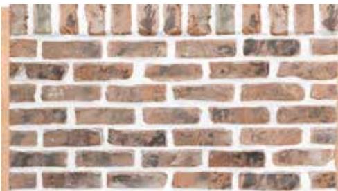
Tumbled Brick USED BRICK Style

Each piece varies in texture and shade, making each brick unique, and any project... a WORK OF ART