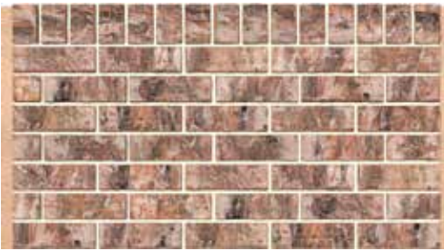
Tumbled Brick Illinois