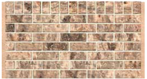
Tumbled Brick Oregon