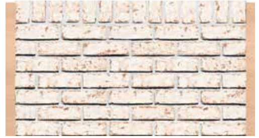
Tumbled Brick Cancun