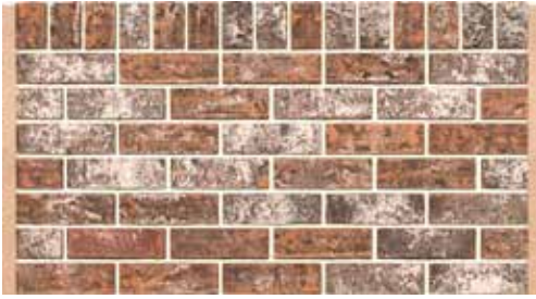
Tumbled Brick Dakota