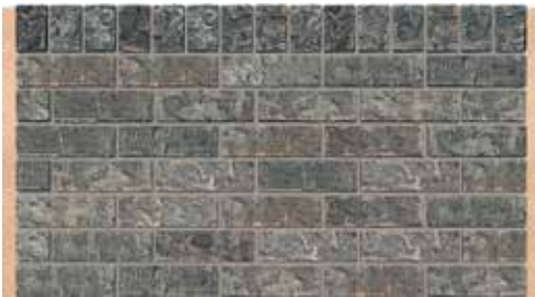
Tumbled Brick Winter London