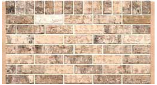
Tumbled Brick Montana