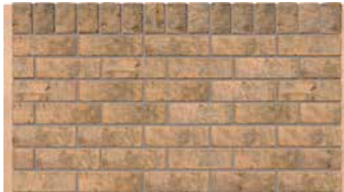
Tumbled Brick Vermont II