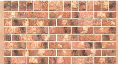
Tumbled Brick Chicago

Is supplied on request. Upon request with minimum of 600 boxes.