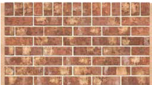
Tumbled Brick Ohio Antique