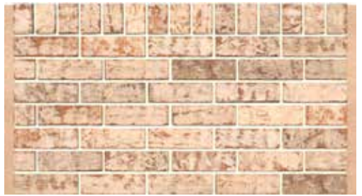
Tumbled Brick Miami