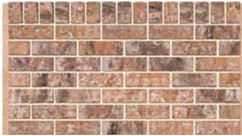
Thin Brick Illinois