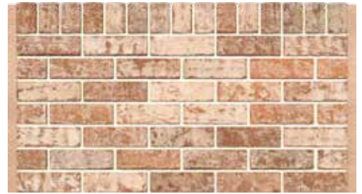
Thin Brick Miami