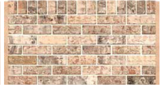
Thin Brick Montana