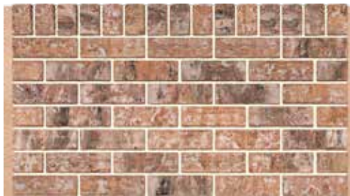
Thin Brick Illinois