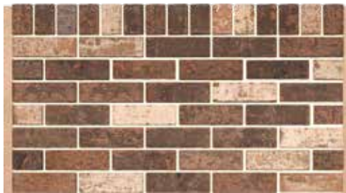
Thin Brick Boston