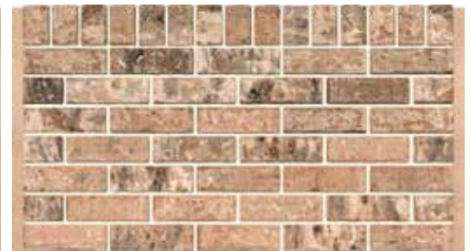
Thin Brick Oregon