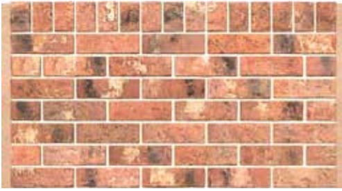
Thin Brick Chicago

Is supplied on request. Upon request with minimum of 600 boxes.