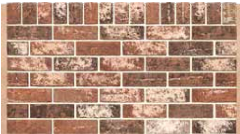
Thin Brick Georgia