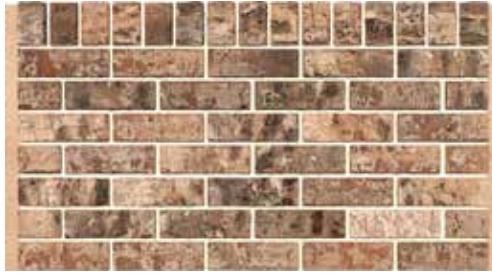
Thin Brick Colorado