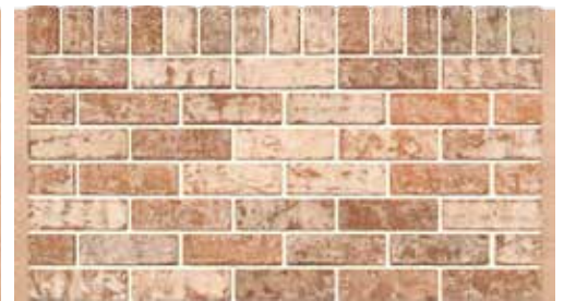
Thin Brick Miami