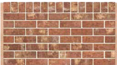
Thin Brick Ohio Antique