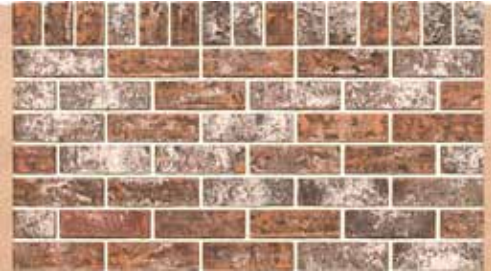
Thin Brick Dakota