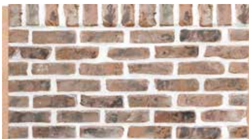
Thin Brick USED BRICK Style

Each piece varies in texture and shade, making each brick unique, and any project... a WORK OF ART